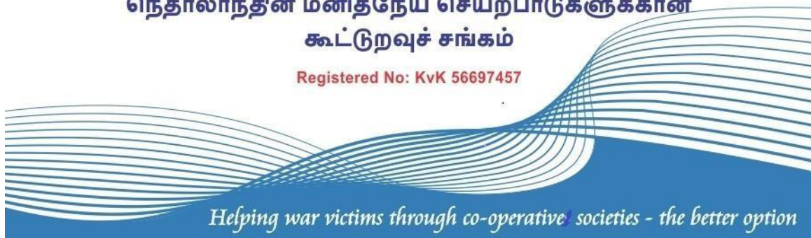
Banner of the CSNHA